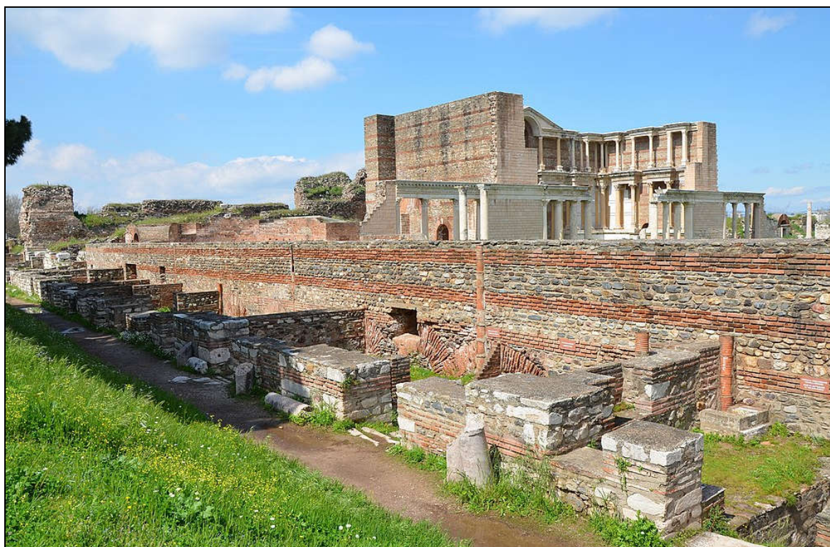
Remains of the Greek Byzantine shops and the bath-gymnasium complex in Sardis