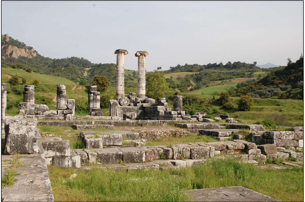
Ruins of ancient Sardis — Eunapius' birthplace